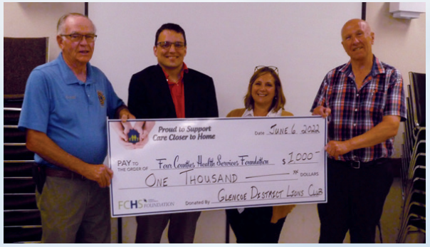
Glencoe District Lions Club - $1,000