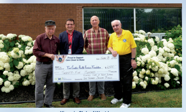
Kiwanis Club of West Lorne St Thomas Jackpot Bingo - $2,500