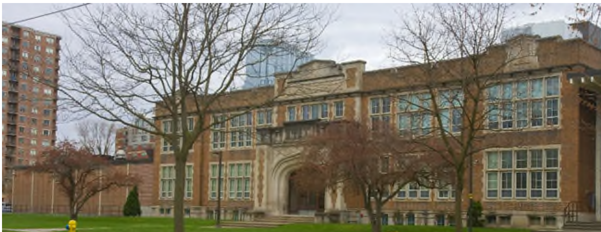
Central secondary school

By Patrick Maloney, The London Free Press Sunday, April 19, 2015 10:03:20 EDT PM