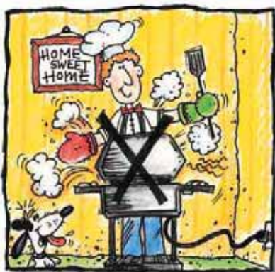
Don't barbecue indoors!