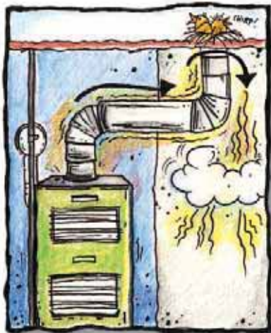
Blocked furnace vent

including adding new windows and additional insulation, consult a qualified heating contractor. Changes may upset the operation of existing appliances.